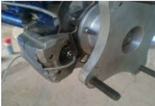
Figure 3 - Mounting the caliper with the thermocouple in the vehicle.

In the third stage the vehicle went down completely, about 64 meters, with partial braking, that is, with friction between the pellet and the disc without the complete stop of the vehicle. After the end of the descent, the temperature data were collected by the thermocouple and the thermometer.