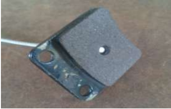
Figure 2 – Thermocouple attached to the brake pad.

was received by a notebook through the Hercules Setup Utility software.