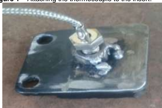
Figure 1 – Attaching the thermocouple to the insert.

In the experimental procedure for the positioning of the thermocouple in the brake pad, a through hole was drilled with a 5mm bit close to the center of the abrasive part of the insert. Then a 6mm hole through the back of the metal, taking care not to go completely, leaving about 2mm of insert. Then, a nut was welded to the metal part so as to leave the holes concentric so as to be able to fix the tip of the thermocouple, as shown in fig. 1 and 2.